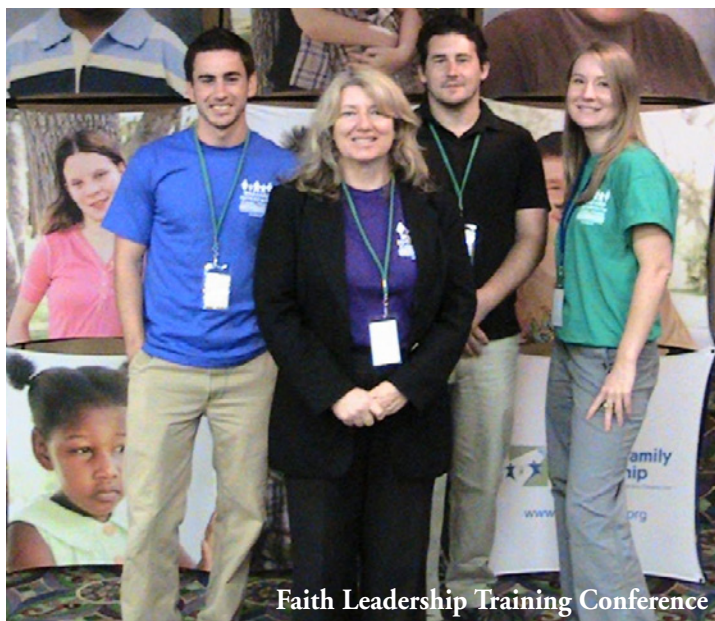
Faith Leadership Training Conference