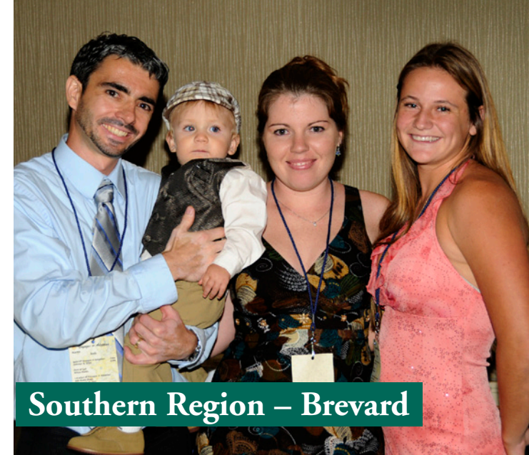
Southern Region – Brevard