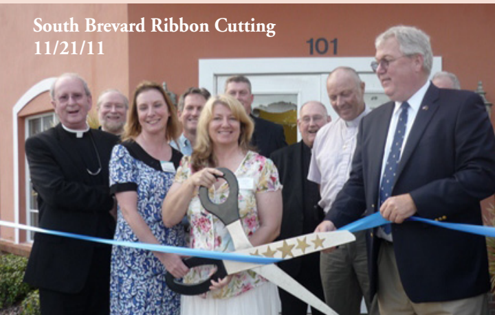
South Brevard Ribbon Cutting 11/21/11

This office is currently being used as a Thrift Store that serves all of Brevard County at 817 Dixon Blvd., Cocoa 32922.